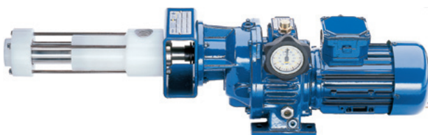
seepex range MD/MDP with housing parts made of HDPE