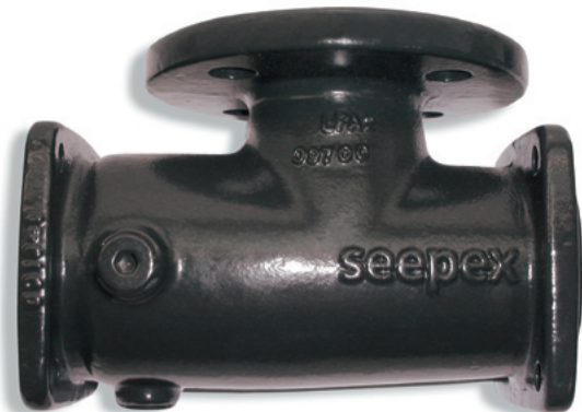
Halar coated suction casing of range BN